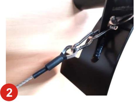
When assembling the boat, attach the wires with the straining devices as shown on the photo.