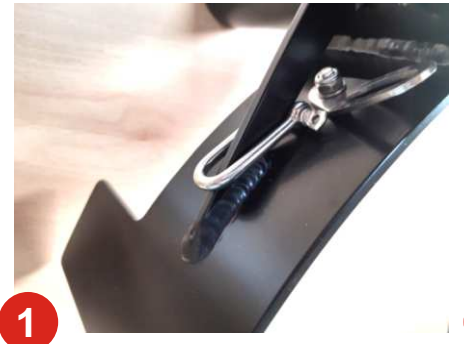
Attach the shackle on the right and left sides of the front frame.